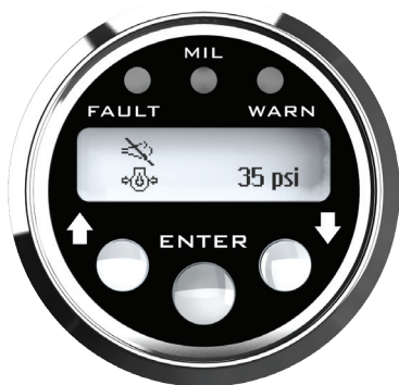
Regen Inhibit Indicator Operation Chart

Instrument Shown with Regen Inhibit Icon Activated