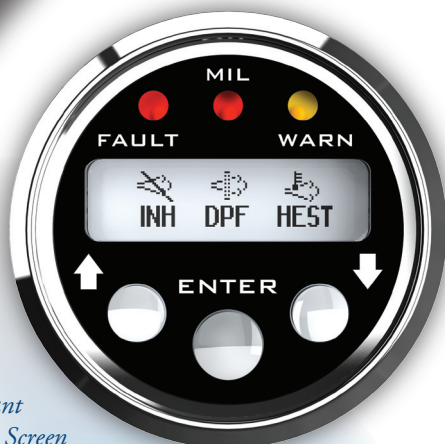
Tier 4 Compliant Start-up Screen